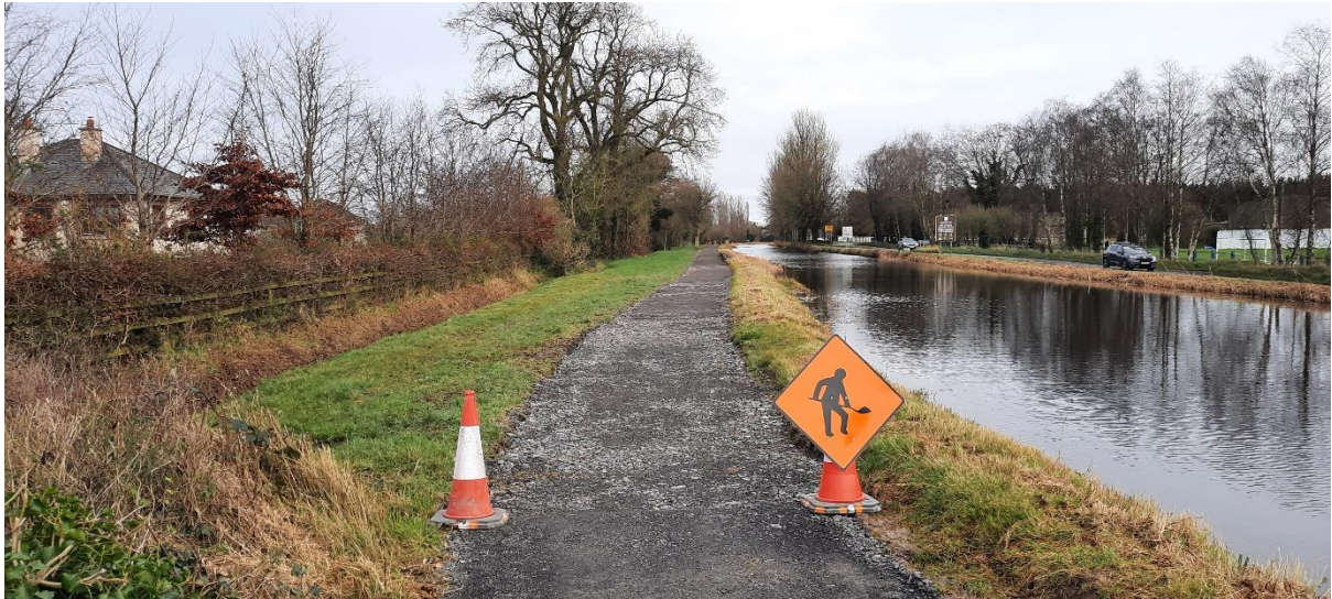
Ummeras Bridge – Works complete end of March