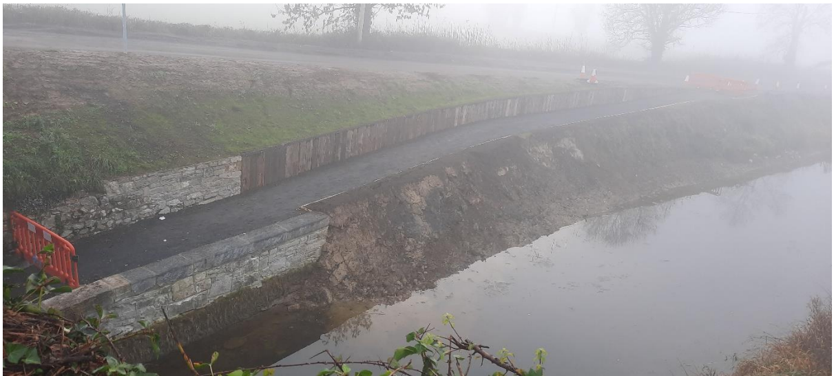
Clogheen Bridge – Works Complete end March